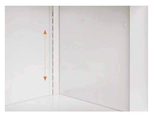
Adjustable shelf panel