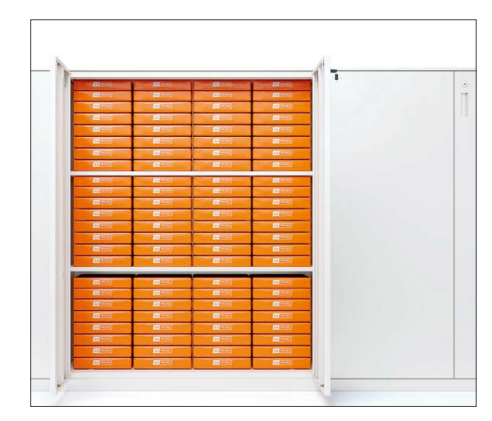
Zero handle Level-two load-bearing